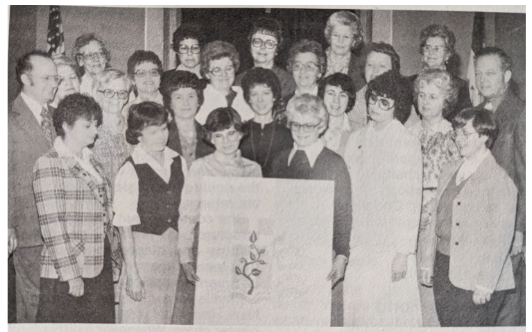
19th Biennial Convention Pilot Committee

We are now celebrating 80 years of LWML, and although we continually update the way we work toward our goals, the goals themselves have not changed; we still cling to our original purpose. We share the Lord's blessings through mites and offerings, reach out to the lost, pray, and study the Bible; we continue to walk by faith, trust in the Lord, and serve Him with gladness. All praise to God!