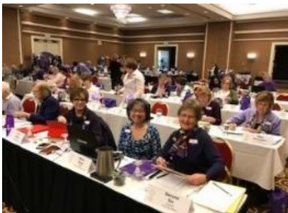
Board members hard at work.